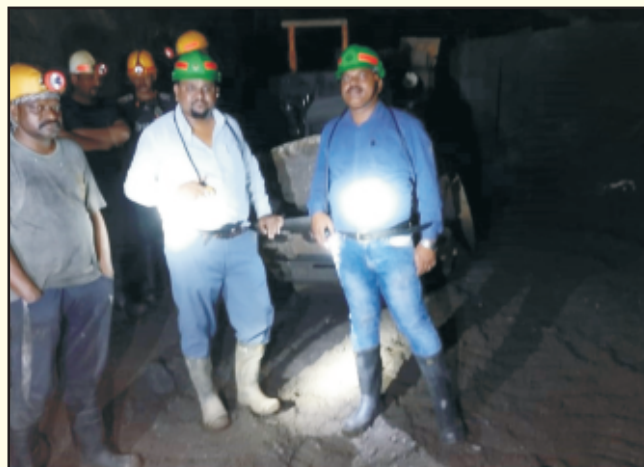
Inspection by VO, MOIL at Munsar Mine