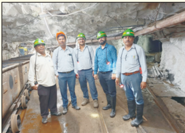
Inspection by VO, MOIL at Kandri Mine